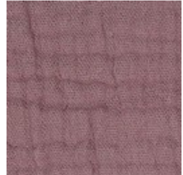
03959.049 LIGHT LILAC