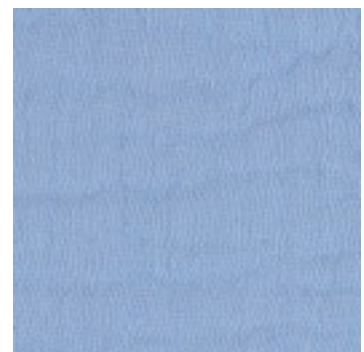
03959.055 LIGHT BLUE