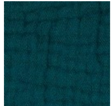
03959.052 DARK CYAN