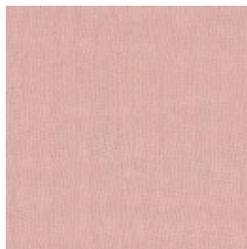
09959.021 LIGHT ROSE