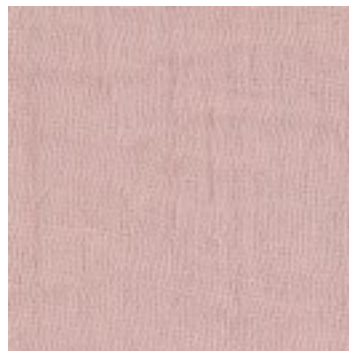
09959.015 SOFT ROSE