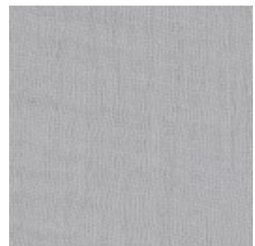
09959.022 LIGHT GREY