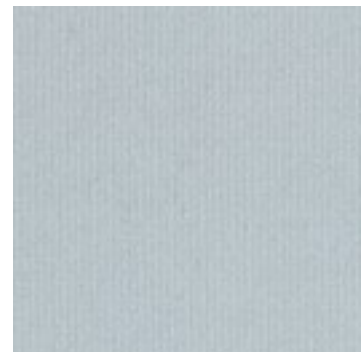
04663.007 PALE TURQOISE