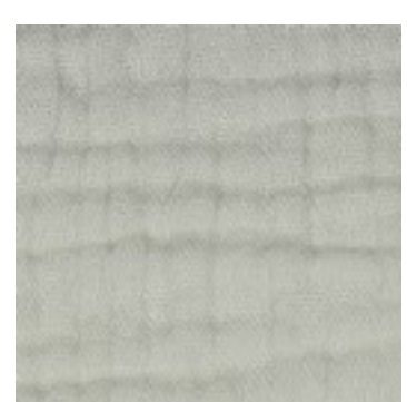
03959.045 LIGHT SAND