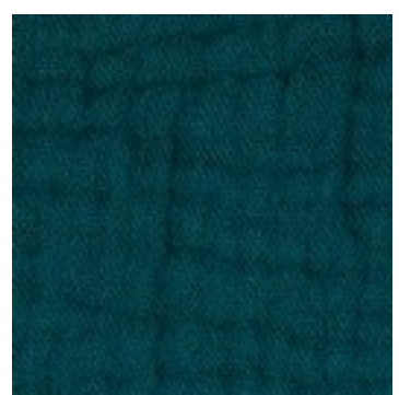
03959.052 DARK CYAN