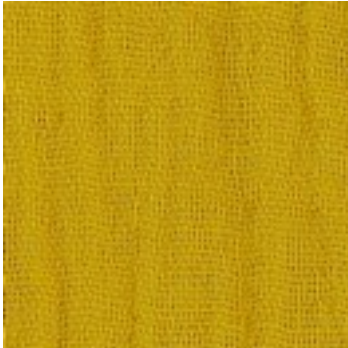
03959.023 DARK YELLOW