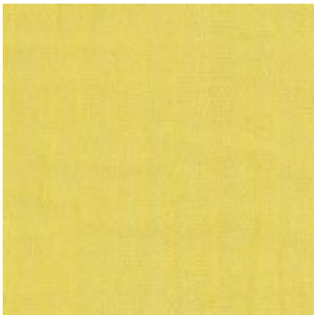
03959.026 SOFT YELLOW