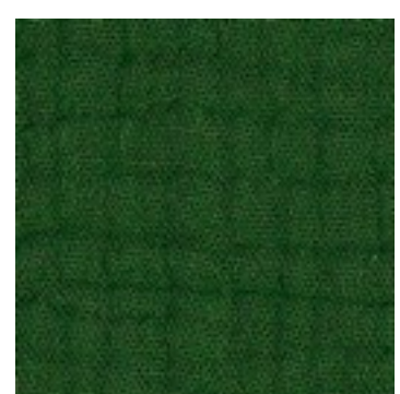
03959.042 DARK GREEN