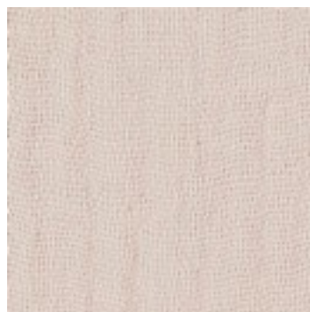
03959.021 LIGHT ROSE