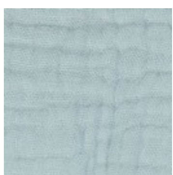
03959.053 BABY BLUE