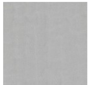
03959.022 LIGHT GREY