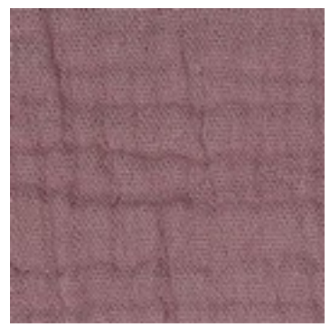
03959.049 LIGHT LILAC