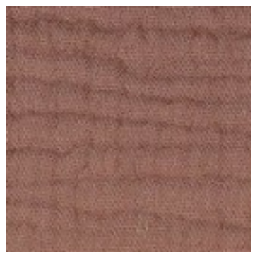
03959.048 OLD BLUSH