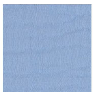
03959.055 LIGHT BLUE