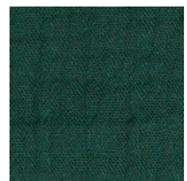
03959.040 OLD GREEN