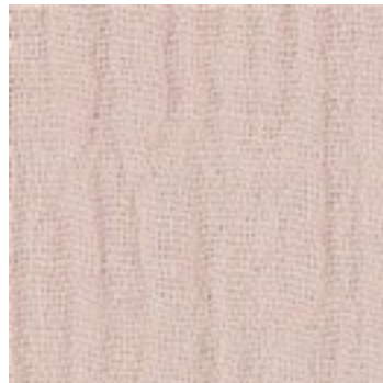
03959.015 SOFT ROSE