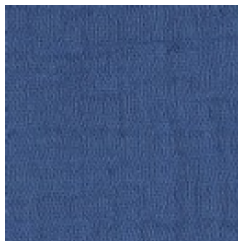
03959.078 MIDNIGHT BLUE