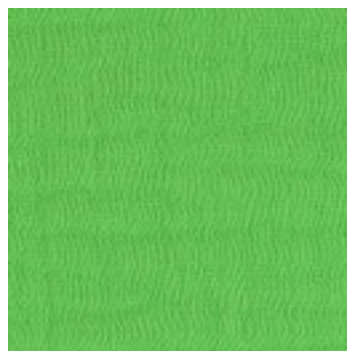
03959.069 LIME NEON