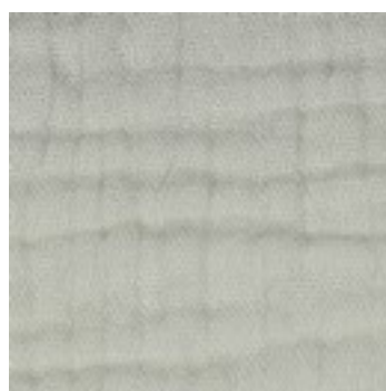
03959.045 LIGHT SAND