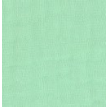
03959.072 LIGHT LIME