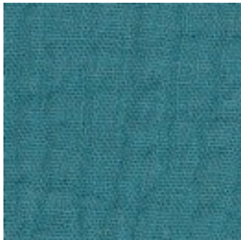
03959.038 BLUE SHADOW