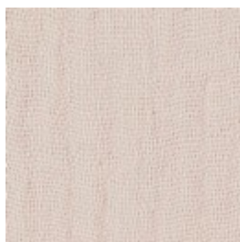
03959.021 LIGHT ROSE