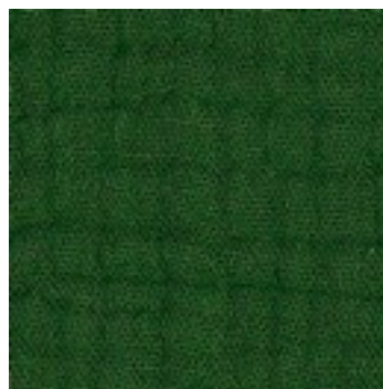
03959.042 DARK GREEN