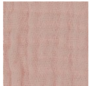
03959.007 OLD ROSE