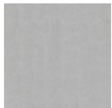
03959.022 LIGHT GREY