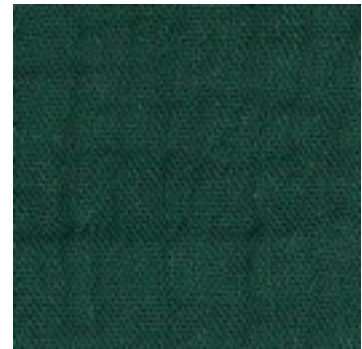
03959.040 OLD GREEN