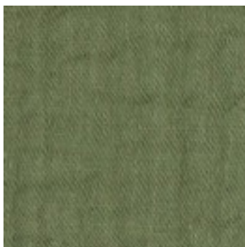
03959.041 MOSS GREEN