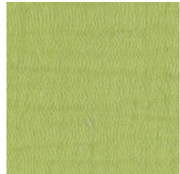
03959.064 OLD LIME