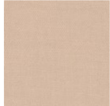
03959.025 LIGHT SALMON