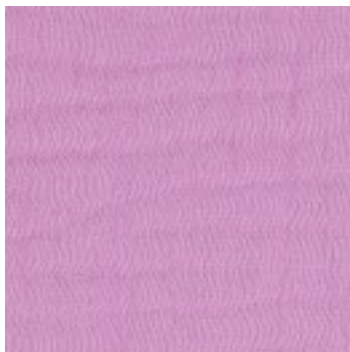
03959.065 LIGHT PINK