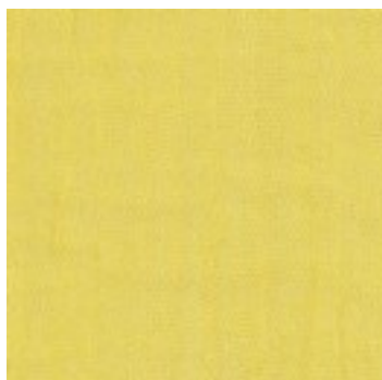
03959.026 SOFT YELLOW