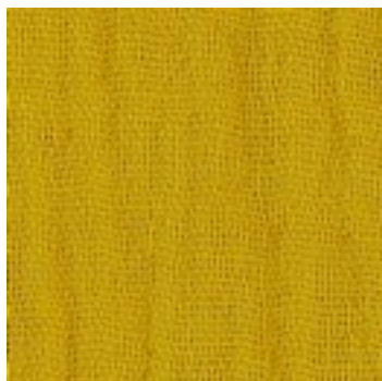
03959.023 DARK YELLOW