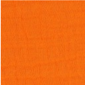
03959.071 ORANGE NEON