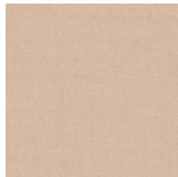
03959.025 LIGHT SALMON