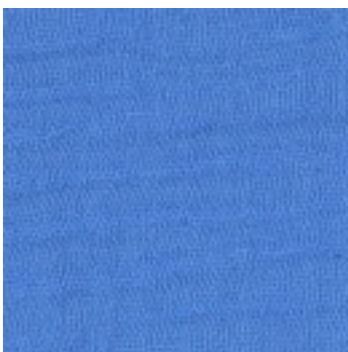
03959.077 ROYAL BLUE