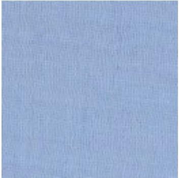
09959.055 LIGHT BLUE