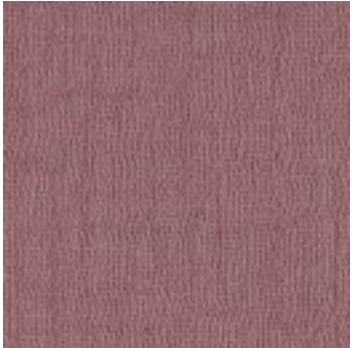
09959.049 LIGHT LILAC