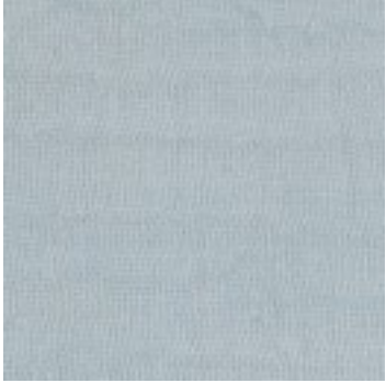
09959.053 BABY BLUE