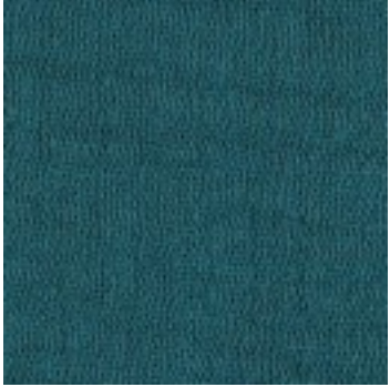
09959.052 DARK CYAN