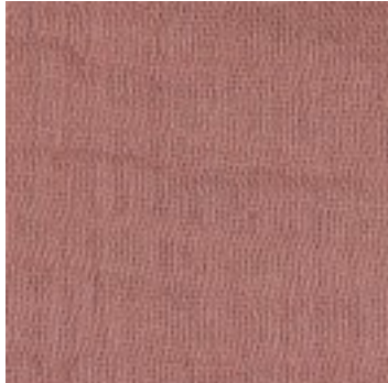
09959.048 OLD BLUSH