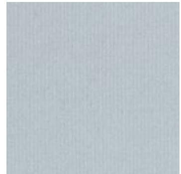
04663.007 PALE TURQOISE