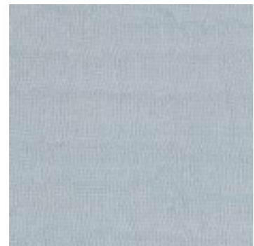
09959.053 BABY BLUE