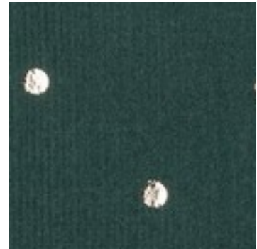
04662.003 DARK GREEN