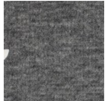
05624.017 GREY MELANGE