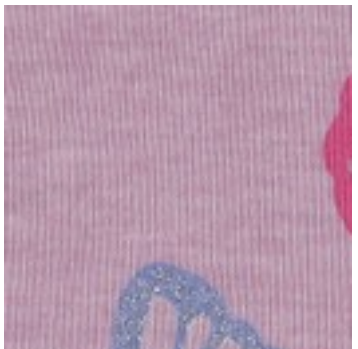
05663.019 LILAC MELANGE