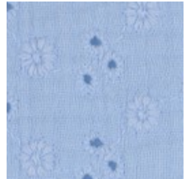
04922.004 LIGHT BLUE