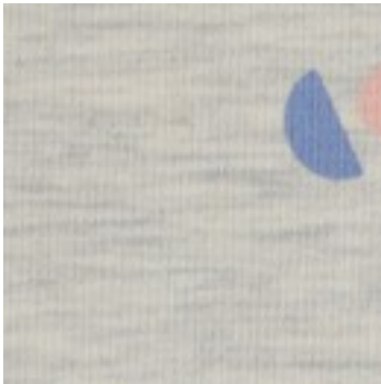
05332.001 ECRU MELANGE