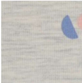
05332.001 ECRU MELANGE