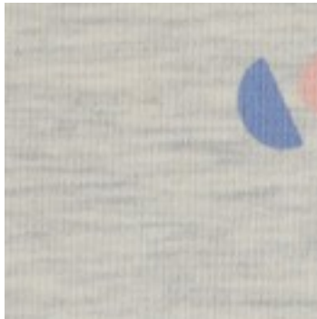
05332.001 ECRU MELANGE