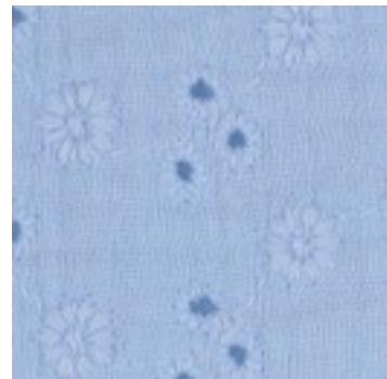
04922.004 LIGHT BLUE