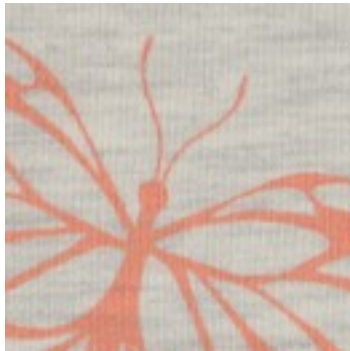
05663.001 ECRU MELANGE