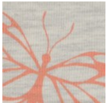
05663.001 ECRU MELANGE