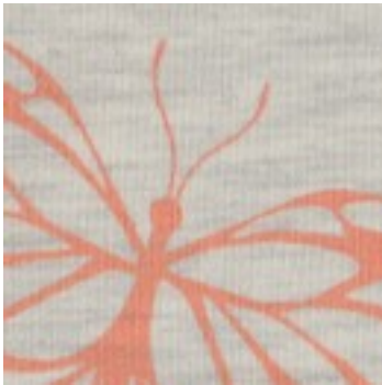
05663.001 ECRU MELANGE