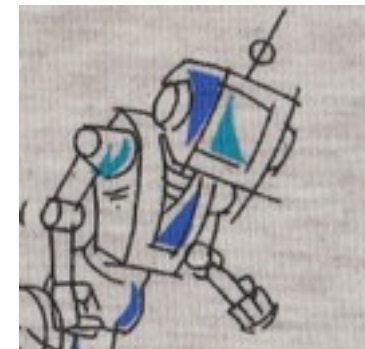
05333.037 LIGHT SAND MELANGE