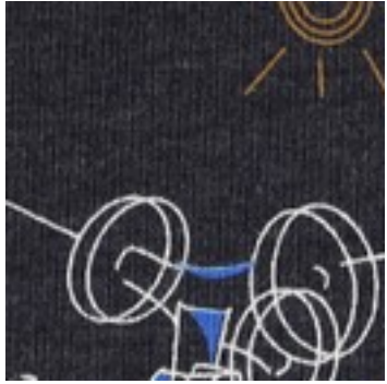
05333.005 INDIGO MELANGE