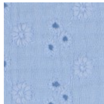
04922.004 LIGHT BLUE