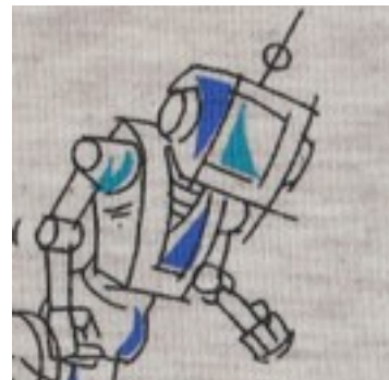
05333.037 LIGHT SAND MELANGE