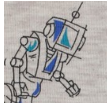
05333.037 LIGHT SAND MELANGE