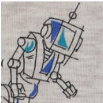
05333.037 LIGHT SAND MELANGE