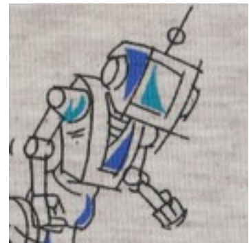
05333.037 LIGHT SAND MELANGE