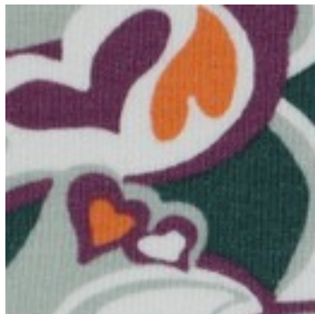
05439.005 DARK PETROL