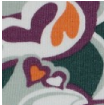
05439.005 DARK PETROL