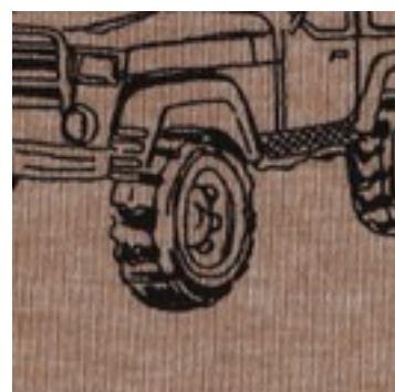
05328.016 TAUPE MELANGE