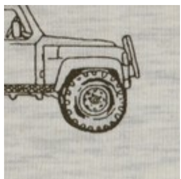
05328.001 ECRU MELANGE