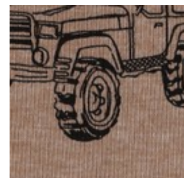
05328.016 TAUPE MELANGE