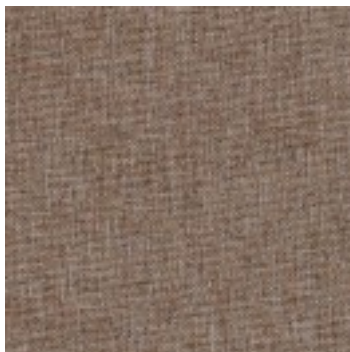
04589.004 LIGHT BROWN