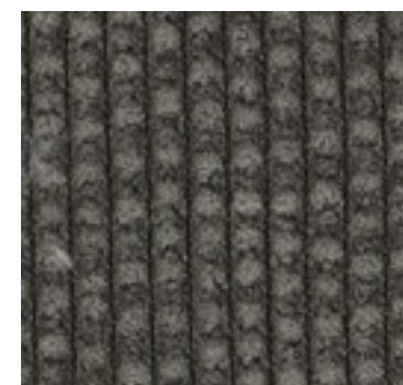
04432.006 MOSS GREEN