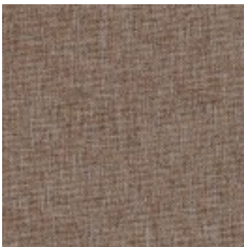
04589.004 LIGHT BROWN