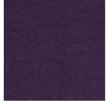
04481.024 DARK PURPLE