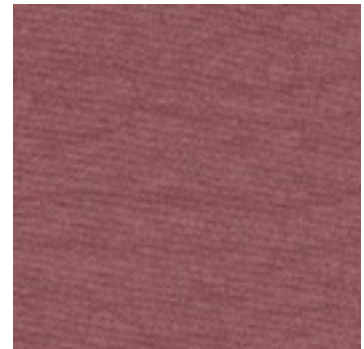
04481.015 DARK BLUSH