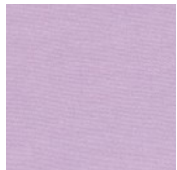
04481.021 LIGHT LILAC