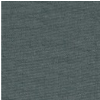
04481.013 OLD GREEN