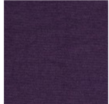
04481.024 DARK PURPLE