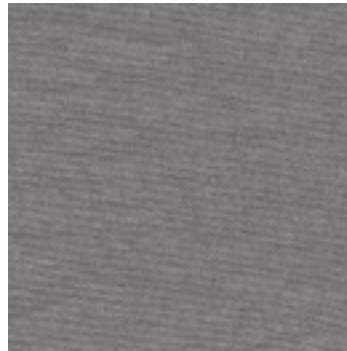
04481.002 DARK GREY