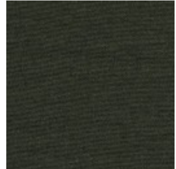
04481.012 DARK GREEN