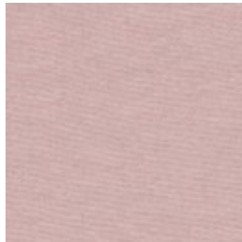
04481.014 OLD ROSE