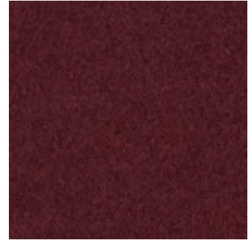
03783.045 WINE RED