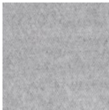
03783.038 LIGHT GREY MELANGE