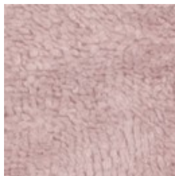
08850.011 OLD LILAC