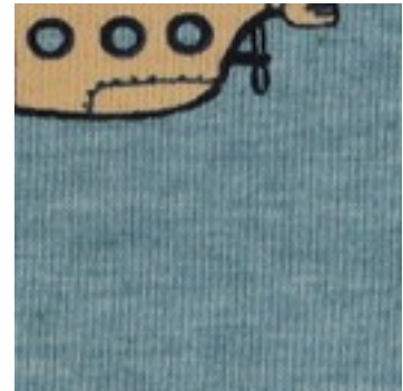
05823.032 SMOKE BLUE