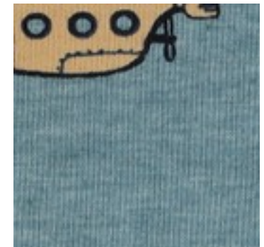
05823.032 SMOKE BLUE