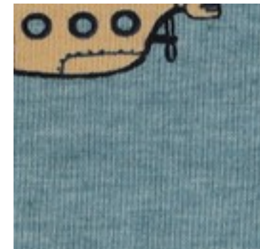
05823.032 SMOKE BLUE