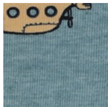
05823.032 SMOKE BLUE