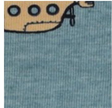
05823.032 SMOKE BLUE