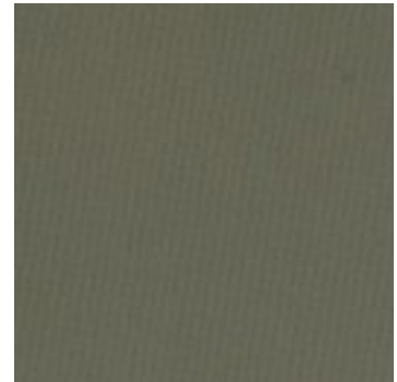
04442.003 ARMY GREEN