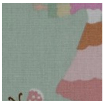
06040.003 LIGHT MINT