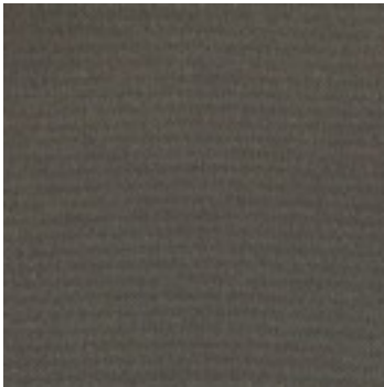
05924.003 ARMY GREEN