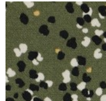
06123.007 MOSS GREEN