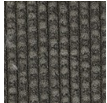
04432.006 MOSS GREEN