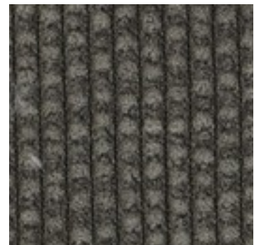
04432.006 MOSS GREEN