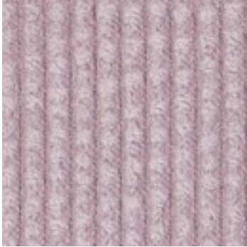
04377.010 OLD PURPLE