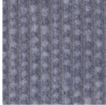
04377.011 DARK LAVENDER