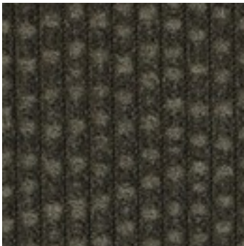
04377.004 ARMY GREEN