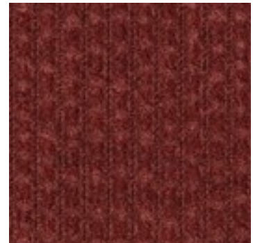
04377.006 DARK ROSE